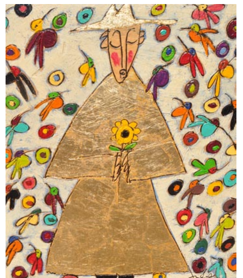
Work by Tres Taylor

When experiencing Taylor’s work, you can sense the feeling of pure joy that surrounds the paintings like an aura. It flows free and envelops the viewer. The rich, bright colors are uplifting. The subjects, be they animals, landscapes, or figures, appear caught in a moment of sweet commune