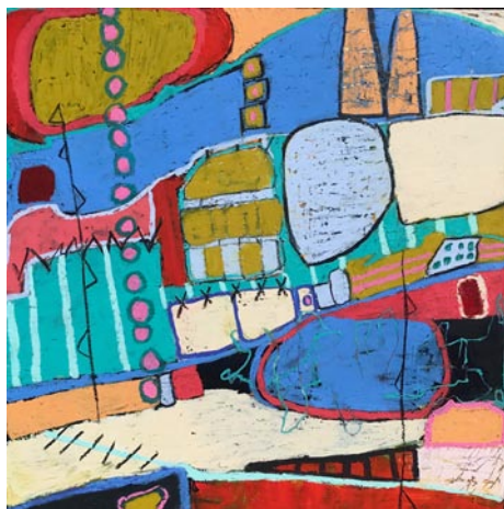
Work by Cindy Walton

When the COVID-19 lockdown period arrived in March of 2020, I found myself at home "limited" by place and workspace, however, without the limitation of a certain amount of time to create. Having been a painter most of my adult life, I found myself wanting to explore different ways of expressing myself beyond the abstractions of recent years such as "The Water Series". I began constructing assemblages of torn paintings on paper, repurposed by weaving, sewing, and gluing to create new painting surfaces. As the limitations of the