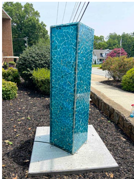
Work by TuxedoKat

As with all exhibitions at The Galleries, a series of events will take place during the show's run including: Family Day on June 10, from 1-4pm; a Stage Performance on June 22, from