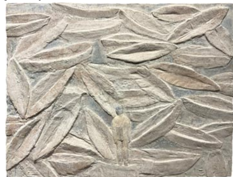
Work by Raul Diaz

For further information check our NC Commercial Gallery listings, call the gallery at 704/365.3000 or visit ( www.jeraldmelberg.com ).