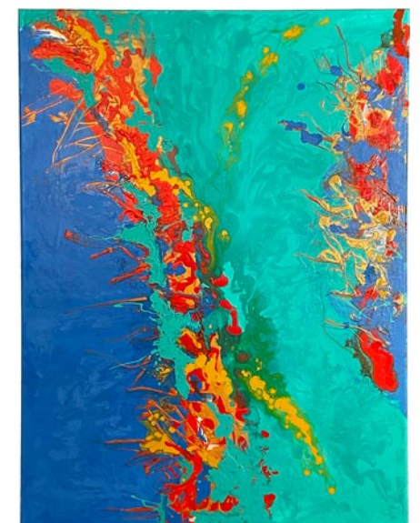
Work by Jane Nodine

Cherokee Alliance of Visual Artists Gallery , 210 West Frederick Street, located in the former Old Post Office building one street over from the Main Street with the City of Gaff-