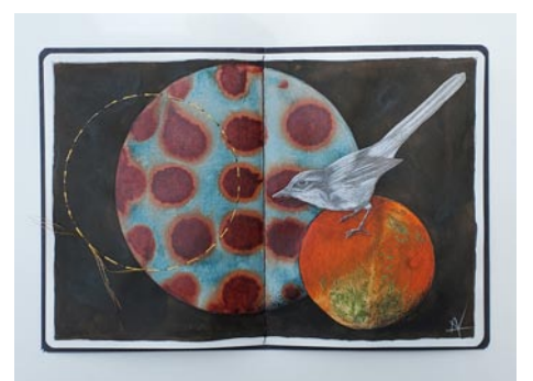
Work by Virginia Russo

This show explores two distinct approaches to the life of the world. Virginia Russo's work is an intensely personal unfolding of a mysterious inner world, exploring things external and internal, seen and unseen. Rissa Berlin's work reveals the poetry of patterns and movements in nature, focusing primarily on birds while juxtaposing