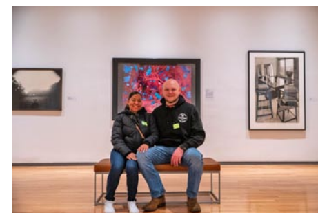
Visitors enjoying the CMA Collection.

Access for All represents a sweeping effort to get people back to museums after COVID-19 brought declines in revenue, staffing, and attendance. With many museums seeing just 71 percent of their pre-pandemic attendance, Access for All