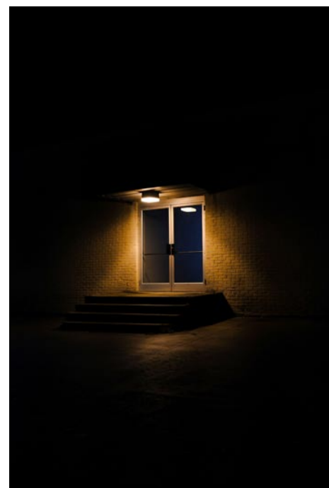
Work by Nolan Smock

For further information check our NC Institutional Gallery listings, call the Center at 252/291-4329 x107 or visit (www.wilsonarts.com).