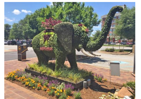
One of the works at Greenwood's 2024 SC Festival of Flowers

Landscaped areas in Uptown Greenwood, June 1 - 30, 2024 - "17th Anniversary Topiary Celebration," during the annual SC Festival of Flowers. When it comes to flowers, everyone loves the topiaries - from the majestic elephant to the dabbling ducks to the Safari Jeep. You will be astonished to see the variety of sculpture sizes, plants, colors and textures. In all, 49 unique "living" creations are uniquely set in landscaped areas in Uptown Greenwood. Each topiary has been adopted by an organization and is sponsored by a separate organization. Contact: ( www.scfestivalofflowers.org ).