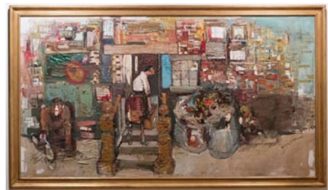
Benny Andrews (1930-2006), "The Arrival", 1960, oil and collage on canvas, H. 51-1/4" x W. 93-3/4", On view now in "Collection Highlights: African-American Art".