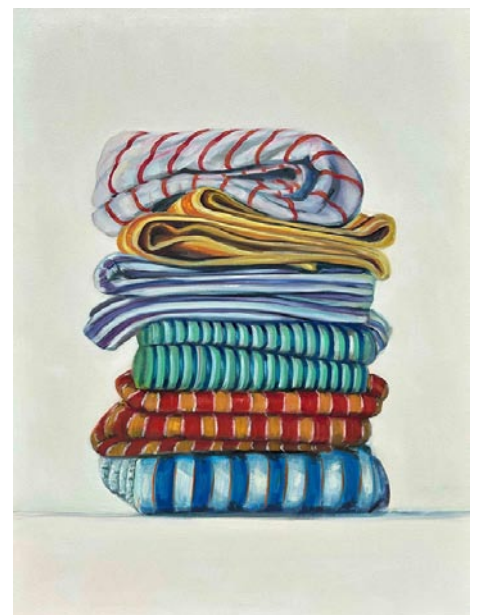
Work by Sally Tharp

The Sportsman's Gallery , 165 King Street, Charleston. Ongoing - Featuring one of the largest, most diverse collections of contemporary sporting and wildlife art found today and once having viewed it, we are confident you will concur. Hours: Mon.-Fri., 10:30am-5:30pm, Sat., 11am-5pm or by appt. Contact: 843/727-1224 or at ( www.sportsmansgallery.com ).