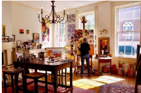
View inside Rhett Thurman's Studio

Revealed Art Gallery , 119-A Church Street, Charleston. Ongoing - Revealed is a contemporary art gallery in Charleston, SC. Located in the French Quarter, it features a vibrant compilation of artists that vary in style and medium. Revealed's collection offers a range of creative gems for both locals and visitors to discover. All are welcome and encouraged to explore this new and unique space. Hours: Mon.-Sat., 11am-5pm & Sun. noon-4pm. Contact: 843.872.5606 or at ( www.revealedgallery.com ).