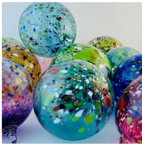
Works from Conway Glass

Conway Glass Center , 708 12th Ave., historic Creel Oil building Conway. Ongoing - Featuring an open-air gallery and glass educational studio dedicated to raising the awareness of the visual arts in Conway and Horry County, SC. Hours: Tues., Thurs. & Fri., by appt. 10am-5pm; & Wed., 10am-5pm, no appt. needed. We have self-service pickup available 24 hours a day. Contact: 843/248-3558, or at ( www.conwayglass.com ).