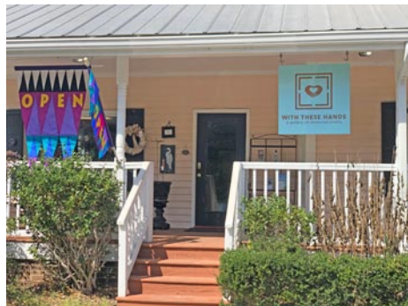
View of the front of With These Hands Gallery