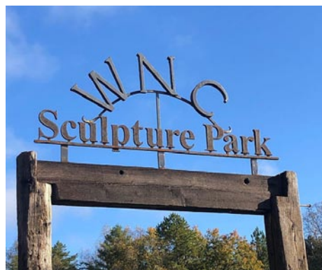
WNC Sculpture Center & Park in Lenoir, NC

Western North Carolina Sculpture Center & Park , 4612 Patterson School Drive, Lenoir. Ongoing - The Western North Carolina Sculpture Center & Park is dedicated to connecting people with the arts through exhibitions, interactions with artists, and the opportunity to experience creative processes in an inclusive environment. The WNC Sculpture Park is on track to hit the 100 sculptures mark this year, a great milestone to coincide with its 5th year anniversary. Hours: e-mail for hours. Contact: e-mail at ( wncsculpture@gmail.com ) or at ( www.wncsculpture.org ).