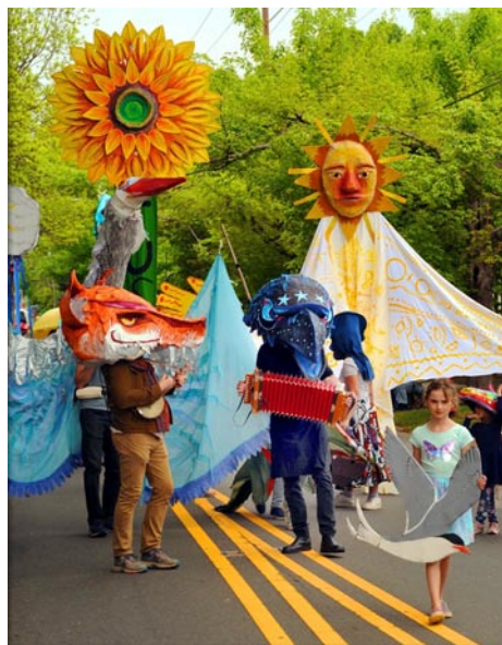
View of previous Hillsborough's Legendary Handmade Parade