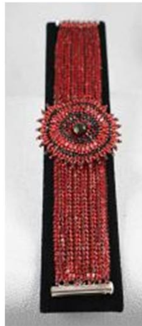
Jewelry by Gwen Pollard