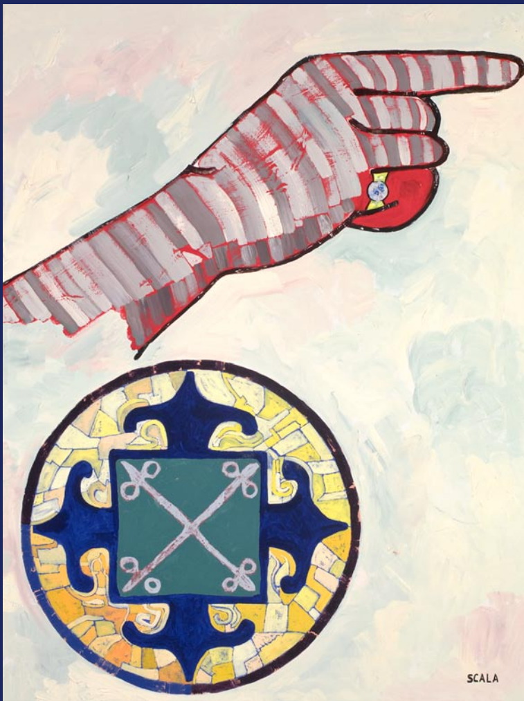
"Prisoner of Conception"