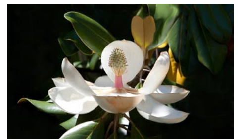
Work by Lloyd Flemming

"To this day I believe my photographic endeavors are influenced by the Chinese artists I met in Taiwan. The Chinese taught me that simplicity and the sublime are more important than the complex and