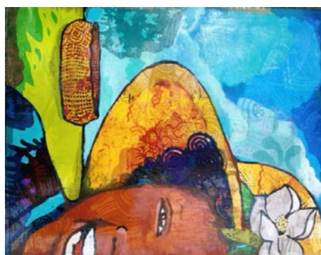
Work by Amiri Farris

continued above on next column to the right