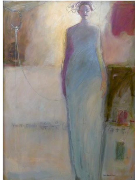
Woman Contemplating Art as it Applies to Science by Harriet Goode

New Bern ArtWorks & Company in New Bern, NC, will present an exhibit of works by figure painter Harriet Goode, on view from July 13 through Aug. 31, 2012. A reception will be held on July 13, from 5-8pm, during the New Bern downtown Art Walk.