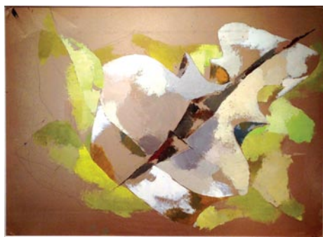
Work by Ati Gropi

campus on the opposite side of US Highway 70 in 1941, now the site of a private K-8 school and a boy’s summer camp. Numerous books and articles have been written about the college, and a documentary film, “Fully Awake,” premiered in 2008.