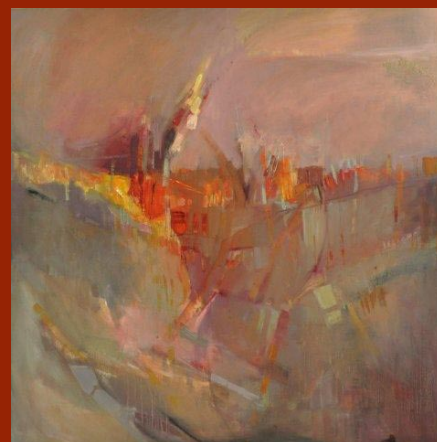
Daybreak oil on canvas 40" x 40"

www.LauraLiberatoreSzweda.net Contemporary Fine Art by appointment