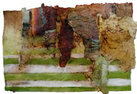
Work by Kristen T. Woodward

Woodward chooses to work in series and several of her series are represented in Why Not Paper? . Some paintings were inspired by the formal compositions of Navajo and Chimayo textiles. Others speak to self-portraiture and personal choice with painted images on papers embedded with photographic elements and Chinese "joss" (money). The paintings in Why Not Paper? may originate from differing inspirations but all share the unique tactile energy of handmade paper.