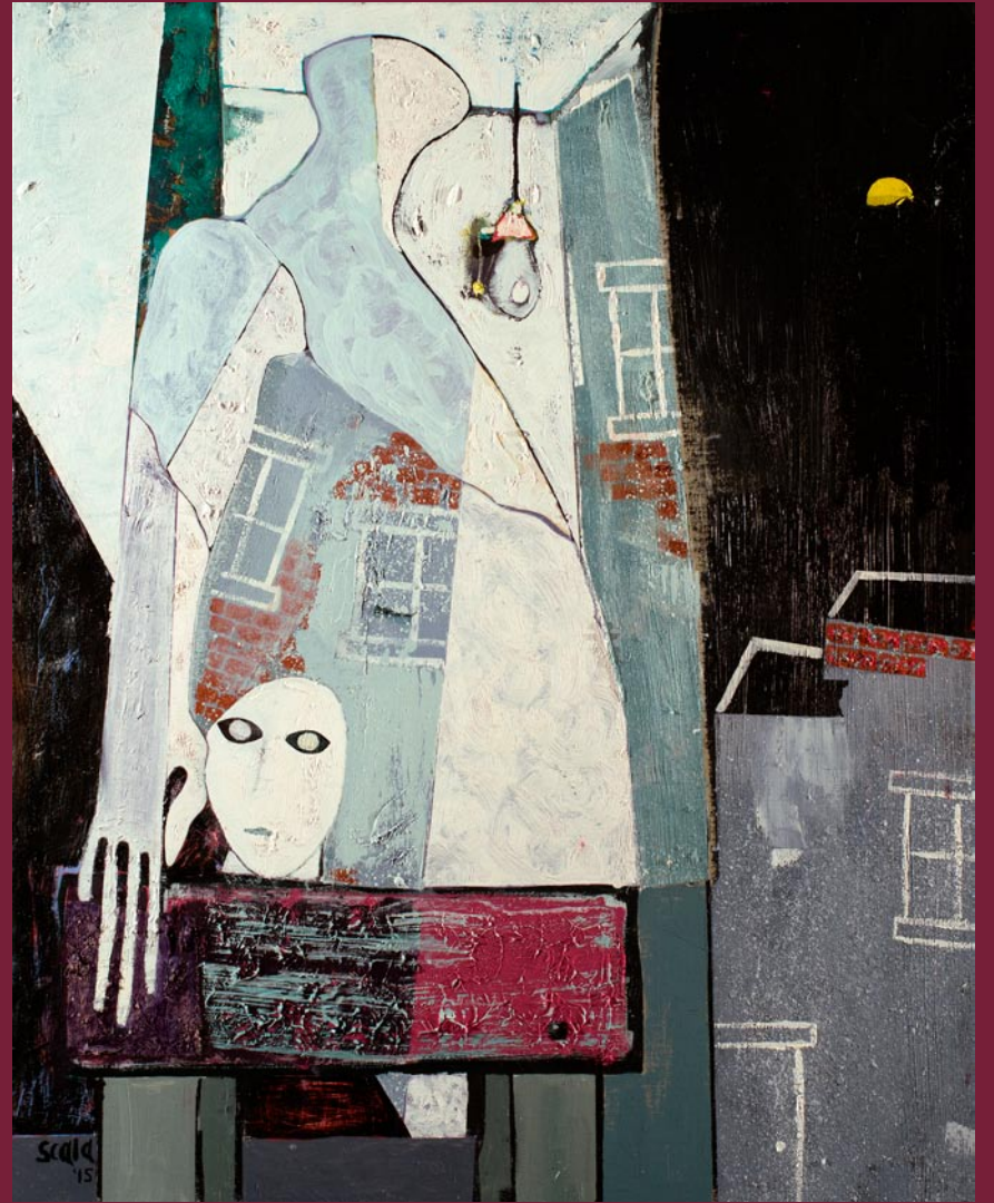
"Leaving the Room" oil on linen 30 x 24 inches