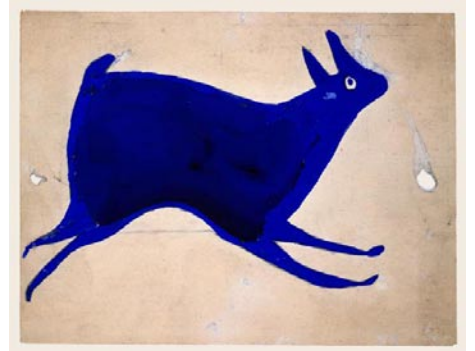
Bill Traylor, "Blue Rabbit Running", 1939-42, poster paint and pencil on cardboard, 9 x 11 7/8 in. The William Louis-Dreyfus Foundation.

and Connelly & Light are pleased to announce the launch of Route to (re)settlement , a four-year exhibition series examining narrative shifts surrounding Black communities in South Carolina - a state which has served as the major gateway between Africa and "African America" - and the permeation of these narratives and related multifaceted heritage throughout America. For further information check our SC Institutional Gallery listings, call Historic Columbia at 803/252-1770 ext. 23 or to schedule a tour, e-mail to ( reservations@historiccolumbia.org ).