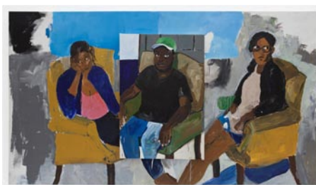
Work by Henry Taylor