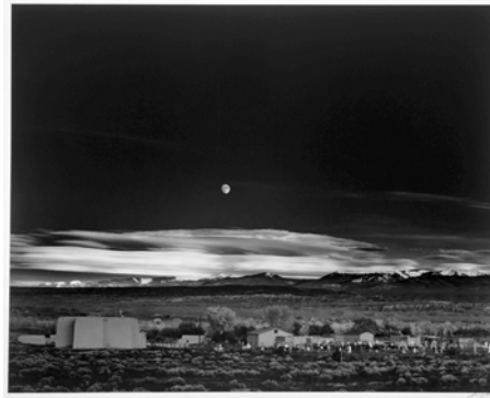
"Moonrise over Hernandez, New Mexico," 1941

ographer in France from 1943 to 1945. He returned to Mary Baldwin College, where he continued to teach until his retirement in 1967. For further information check our SC Institutional Gallery listings, call the Museum at 864/271-7570 or visit ( www.gcma.org ).