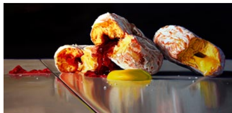
Work by Denise Stewart-Sanabria

The Arts Center of Greenwood in Greenwood, SC, will present Food For Thought , a contemporary food-themed exhibition, on view in the Center's main gallery space, from July 10 through Aug. 31, 2017. A reception will be held on July 28, from 5:30-7:30pm. The exhibition coincides with an upcoming Farm-to-Fork fundraiser at the center in late August.