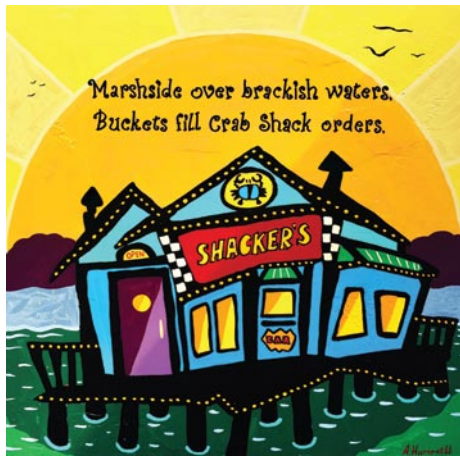
Work by Amos Hummell

For further information check our SC Institutional Gallery listings, call the League at 843/681-5060 or visit ( www.ArtLeagueHHI.org ).