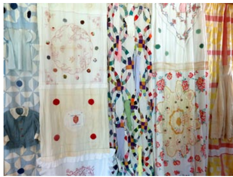
Part of the installation by Susan Lenz in progress

mothers can show daughters how to thread a needle, and that fathers can point out memories from their childhood. This installation pays homage to all those anonymous makers who filled their homes with comfort. Yet, it is also a place to take a stitch, add another doily or piece of lace, without having to follow any hard-and-fast quilting or sewing rules. Anything goes!"