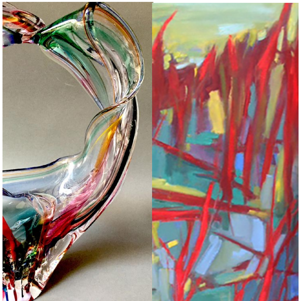
Glass by David Goldhagen/Painting by Holly Nettles

For further information check our NC Commercial Gallery listings, call the gallery at 919/828-3165 or visit ( www.galleryc.net ).