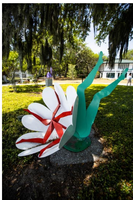
Work by Joni Younkins-Herzog

Best in Show: "The stark simplicity of, Just Around the Bend , by Gregory Smith of North Pownal, VT, set against the wide expanse of the surrounding landscape, surprises with its ability to spark curiosity. Compelled to seek out the meaning between the lines, you move around the piece and notice bends and views that