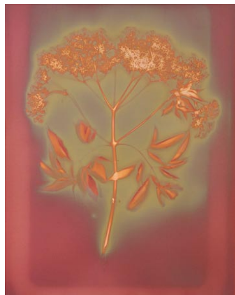
Work by Leslie Burns

In her series, Lumen Prints , photographer Leslie Burns creates images using an early photographic process developed in the 19th century that utilizes sunlight as the developer. The artist arranges cut flowers on light sensitive paper and exposes the paper to sunlight for several hours. The sun darkens the paper and leaves behind an image of the flowers' shadows. Burns then uses a wash that halts the light sensitivity of the paper and preserves the found image. Her interest in this process reflects her admiration for the beauty of nature. "Within this series of images, I act as a conduit, connecting chemical properties of sunshine and light sensitive paper with the natural beauty of flowers. These lumen prints are visual documentation of my reverence for these natural ornate gifts of supreme rhythm and grace."