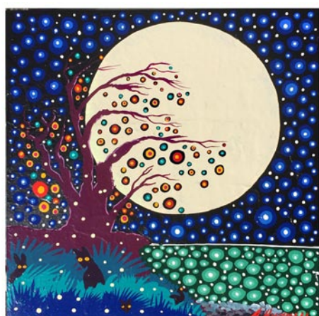
Work by Amos Hummell

For further information check our SC Institutional Gallery listings, call the League at 843/681-5060 or visit ( www.artleaguehhi.org ).