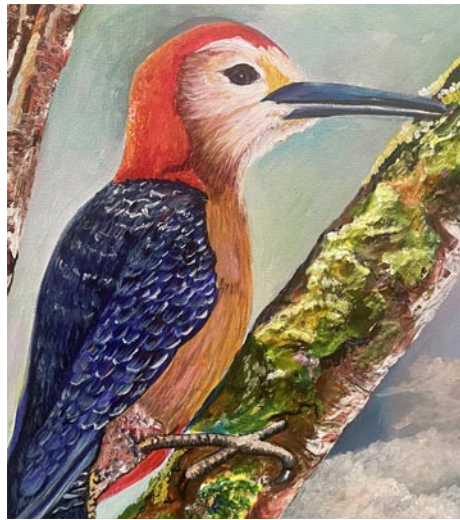
Work by Norman Smith

For further information check our NC Institutional Gallery listings, call the Council at 910/323-1776 or visit ( http://www.theartscouncil.com/ ).