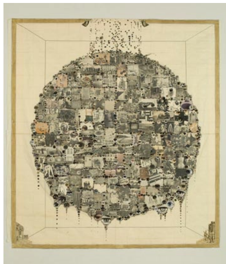
A collage that forms a grid inside of a large circle. There are black and white images from art history books and hundreds of eyes dripping from the collage. Casablanca (Classic) , 2003-2006. Collage on Okawara paper with silk tissue. Collection of the Aldwyth Trust

For further information check our NC Institutional Gallery listings, call the Council at 919/249-1120 or visit ( http://thehalle.org ).