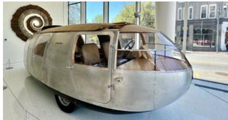
Replica of R. Buckminster Fuller's "Dymaxion Car" arrived at the Museum today. The vehicle is on loan from the Lane Motor Museum in Nashville, TN, and on view through the duration of the exhibition.