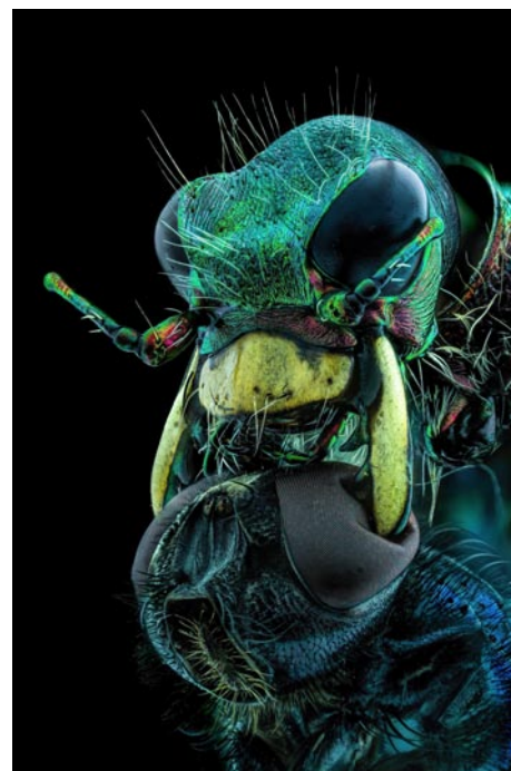
Work by Murat Ozturk, "a fly under the chin of a tiger beetle"

This remarkable intersection of science and art inspired Nikon Instruments to create the Small World Competition in 1974 - and 48 years later, it remains the premier photomicrography competition in the