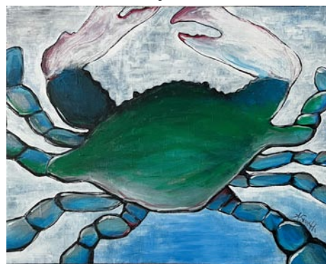
Work by Andrea Smith

The exhibition is a visual adventure in hue and texture, depicting the colors, lush waterlines, and coastal landscapes from an abstracted, aerial perspective. Paired with additional coastal subject matter, she allows texture and movement to show off various interpretations of watery landscapes, flora, and fauna using acrylics, brushes, palette knives, and found objects.