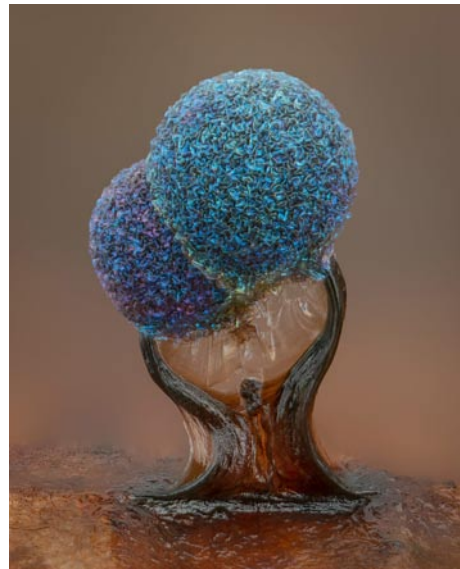
Work by Alison Pollack, "Lamproderma"

The Coastal Discovery Museum is delighted to host the exhibition of the 20 prize-winning images from the 2022 Nikon Small World Competition . Combining microscopy and photography, a photomicrographer is able to capture a glimpse of a world unseen by the naked eye. A photomicrograph may be of great technical significance and, at the same time, a sheer beauty to contemplate.