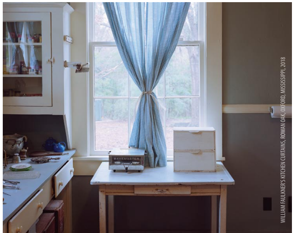
WILLIAM FAULKNER'S KITCHEN CURTAINS, ROWAN OAK, OXFORD, MISSISSIPPI, 2018

ANALOGUES: NORTH & SOUTH Photographs by Tema Stauffer June 9 - Aug. 30, 2024