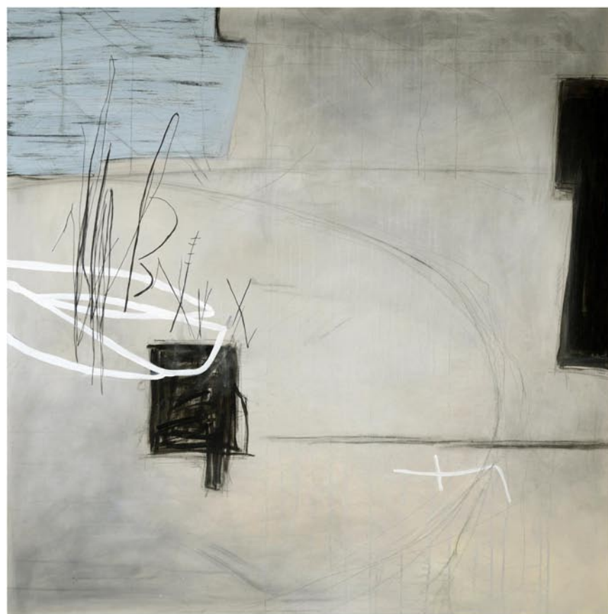
Daliri acrylics on canvas 48 x 48 in.