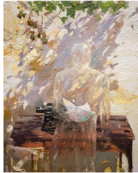
"Dear Dad", 2022, by Reynier Llanes (Cuban-American, b. 1985), Oil and mixed media on canvas, 60 x 40 inches. On loan courtesy of the collection of David and MaryEllen Rogers.

information, please call 843/278-4806 or visit ( gallerybysewe.com ).