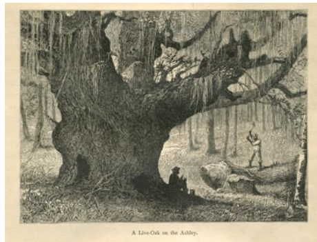
Henry Fenn, "Live Oak on the Ashley" 1880s, etching, from "Picturesque America"

and pencil mediums. Ongoing - Featuring an exhibit of works by over 80 plus members of CAG who display a wealth of talent in different media including, oils, acrylics, pastels, watercolors, photography, printmaking & sculpture. The Gallery is also home for the CAG office. Hours: Daily, 11am-6pm. Contact: 843/722-2454 or at ( www.charlestonartistguild.com ).