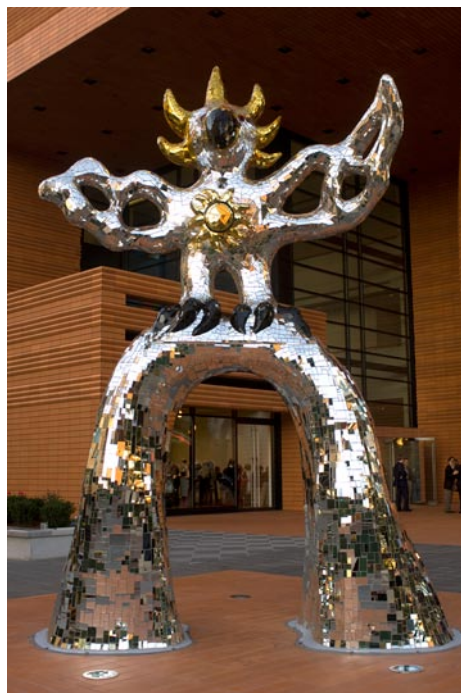
The outside entrance to the Bechtler Museum

South End Art Gallery Crawl - From 5-8pm on the 1st Friday of each month.