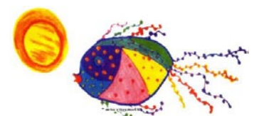
"Fish & Sun"