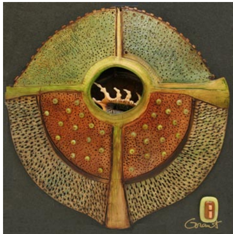
Work by Vicki Grant

Carolina Creations Fine Art and Contemporary Craft Gallery in New Bern, NC, will present an exhibit of works by NC ceramicist Vicki Grant, on view from Aug. 1 - 31, 2011.