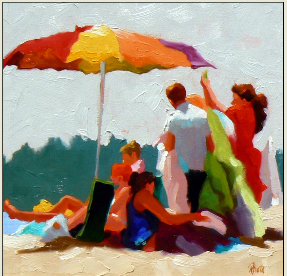
Rhett Thurman Packin' Heat II Oil on canvas