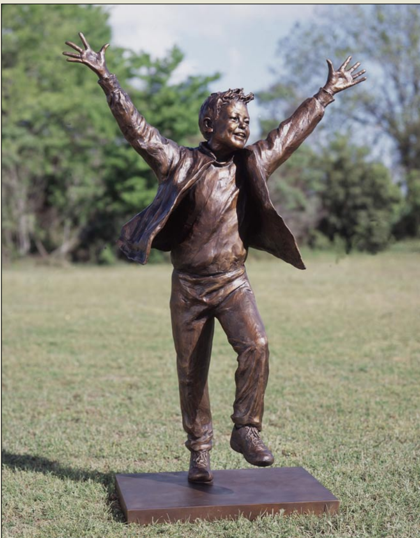
Glenna Goodacre The Winner Lifesize Bronze