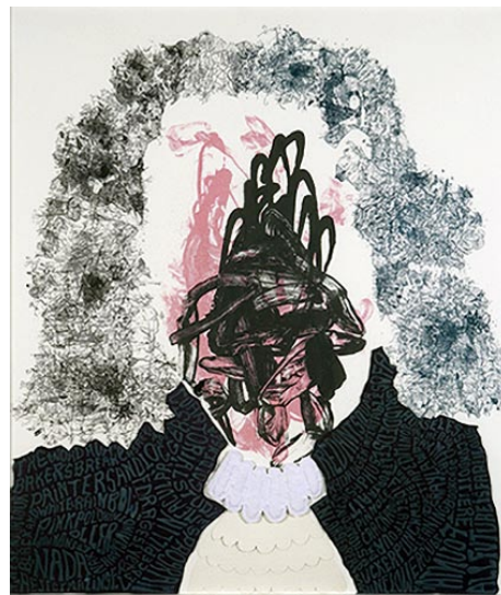
José Lerma, Untitled #1 , 2007, AP2 from 20 + 2AP Lithography, woodcut on Rives BFK and handmade paper - May 2012

For further information check our NC Institutional Gallery listings, call the Museum at 704/353-9200 or visit ( www.bechtler.org ).