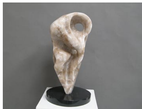
Work by Sharon Collings Licata

Vista Studios in Columbia, SC, will present the exhibit, Sculpture in Bloom , on view in Gallery 80808, from Sept. 6 - 11, 2012. A reception will be held on Sept. 6, from 4-8pm.