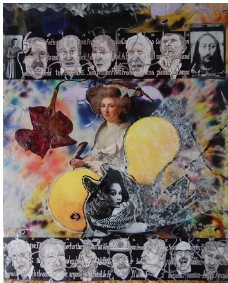
Work by Toni Marcus Elkins

Small Art/Big Heart will include paintings, sculpture and mixed media with an emphasis on work that's 12" x 12" x 12" in dimension or smaller.