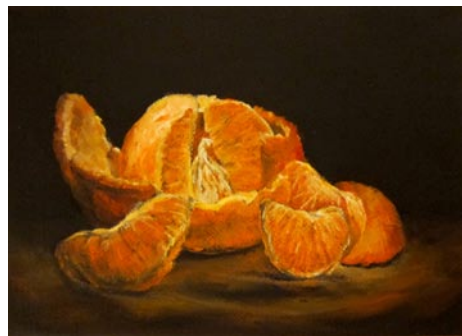
Work by Diane Kraudelt

This genre of visual art has been around since the 1300's as it began with illustrated manuscript painting of the monks. Its zenith of popularity occurred in the 17th century, but the appeal of these small paintings waned after the introduction of photography and the changing tastes of the art world. In the mid 20th century, the interest in producing such works resurfaced in various art societies dedicated to this form.