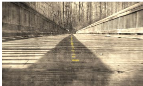
Work by Jim Dukes

Participants were invited to use photography, writing, drawing, painting or mixed