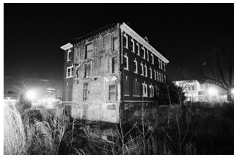
1110 Main Street, McPherson's Hospital.