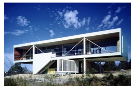
The Julian Rose House, Design/Completion 1949-1950, Wahroonga, Sydney, Australia, Steel structure, timber infill

The Black Mountain College Museum + Arts Center in downtown Asheville, NC, is presenting Harry Seidler: Architecture, Art and Collaborative Design , on view through Sept. 7, 2013. This retrospective exhibition illuminates Seidler's architectural legacy as Australia's most important modernist architect. Seidler studied with Josef Albers at Black Mountain College in the mid-1940s and became a major proponent of Bauhaus principles of design in his architectural practice. For further information check our NC Institutional Gallery listings, call the Museum at 828/350-8484 or visit ( www.blackmountaincollege.org ).