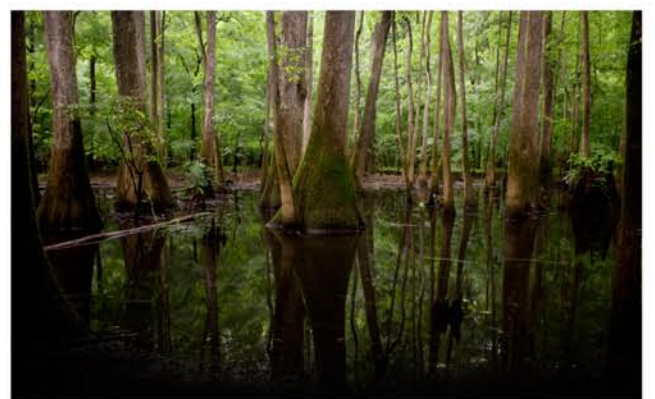
Congaree National Park

The deadline each month to submit articles, photos and ads is the 24th of the month prior to the next issue. This will be Aug. 24th for the September 2013 issue and Sept. 24 for the October 2013 issue. After that, it's too late unless your exhibit runs into the next month.