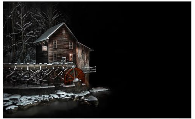
Glade Creek Grist Mill WV