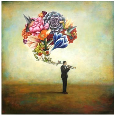
Work by Duy Huynh

Asheville, NC, based potter Julie Covington balances her studio life with farm life, passionately living with as many hand-crafted ingredients as possible. Covington is surrounded by people who fill their days doing such things as felting tiny baby shoes, hunting for wild foods and mushrooms and then concocting mouth-watering feasts out of them, building hand-hewn log cabins and straw bale cottages, growing heirloom vegetables and flowers, whittling little wooden spoons, making bamboo fences, and a thousand other things that fascinate