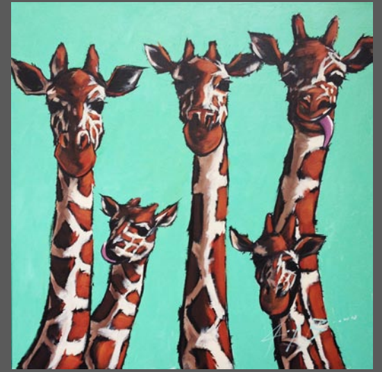
Five Giraffes oil 36 x 36 inches

Opening Reception Friday August 2, 2013 6 - 8:30pm