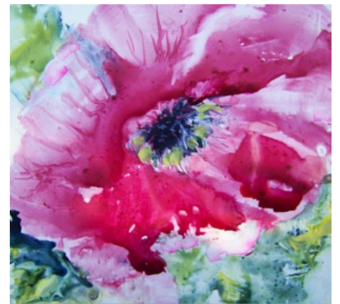
Work by Kathy Leuck

This genre of visual art has been around since the 1300's and began with illustrated manuscript painting of the monks. Its zenith of popularity occurred in the 17th century, and the appeal of these small paintings waned after the introduction of photography and the changing tastes of the art world. In