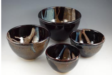
Works from Cady Clayworks