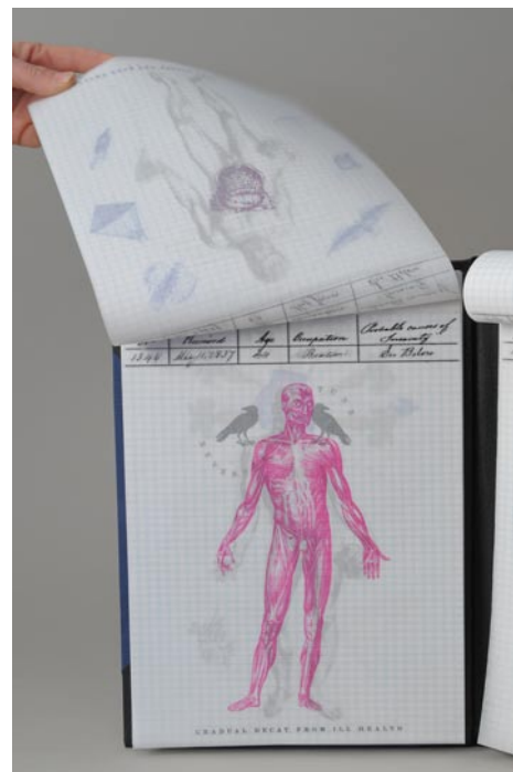
Work by Maureen Cummins

For further information check our NC Institutional Gallery listings, call the collective at 919/636-4135 or visit ( www.frankisart.com ).