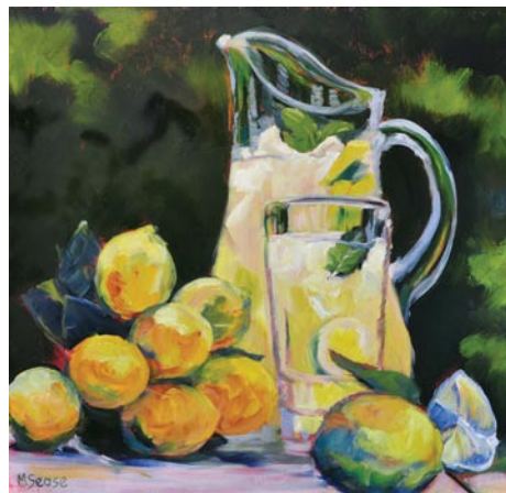
Work by Murray Sease

Society of Bluffton Artists Gallery/Learning Center , 8 Church Street, corner of Calhoun and Church Street, Bluffton. Aug. 5 - Sept. 1 - "Think Cool," featuring a collection of paintings, photography and sculpture by members of the Society of Bluffton Artists. A reception will be held on Aug. 11, from 3-5pm. Ongoing - Featuring works in a variety of mediums by over 100 area artists, with all work moderately priced. Changing shows every six weeks. Hours: Mon. 11am-3pm & Tue.-Sat., 10am-5pm. Contact: 843/757-6586 or at (www.sobagallery.com).