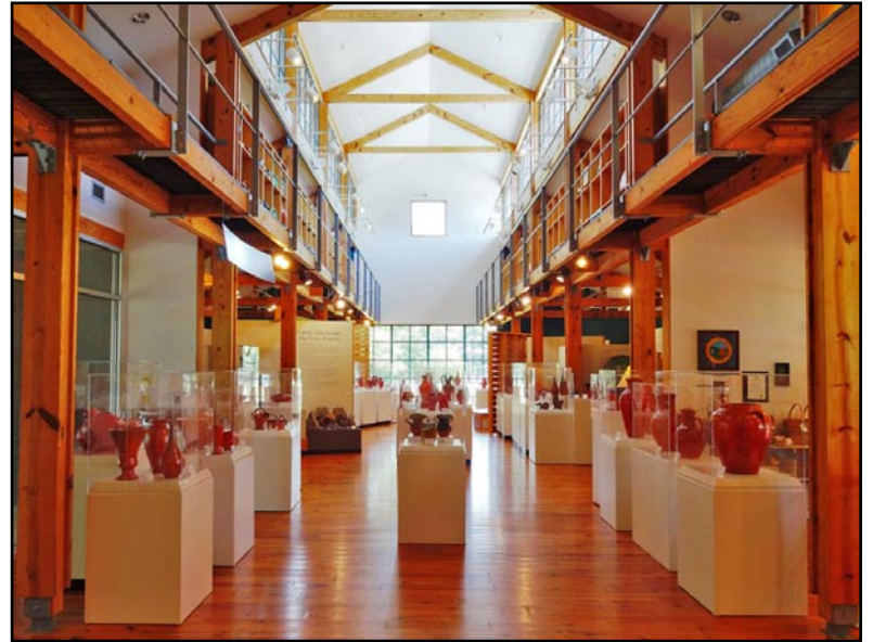
NORTH CAROLINA POTTERY CENTER

info@ncpotterycenter.org www.ncpotterycenter.org