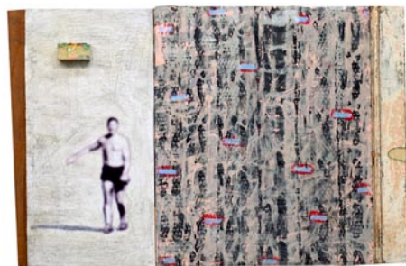
Work by Mark Flowers

Flowers' work of painted layered panels combined with found objects evoke a personal story telling narrative.