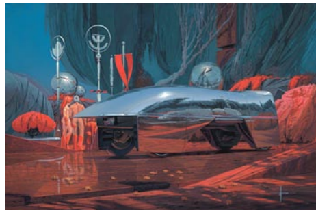
"Hypervan Crimson Plaza," by Syd Mead

The motion picture industry has also recognized Mead's unique ability to "visualize" the future, and his work can be seen in feature films as Star Trek: The Motion Picture , Blade Runner , Short Circuit , Aliens , Time Cop , Johnny Mnemonic , and most recently on Elysium , directed by a Neill Blomkamp and starring Jodi Foster and Matt Damon. Mead has also completed concept and design work for a number of major Japanese clients, including; Sony, Minolta, and Honda, as well as