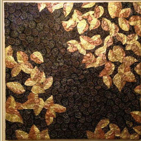
Amelia Sherritt Autumn Gold (2013): recycled wine foils on canvas