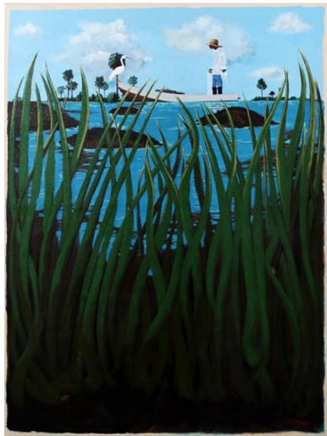
Work by JK Crum

To celebrate its 30th anniversary, the Coastal Discovery Museum will host an exhibition that reveals Honey Horn's beauty, history, and heritage as seen by a wide variety of artists. Two and three dimensional artwork depicting, or inspired by, the unique Honey Horn site, may be submitted for consideration. A few examples of subject matter include: historic buildings, former (or current) residents, recent activities, natural scenery, and historic events.