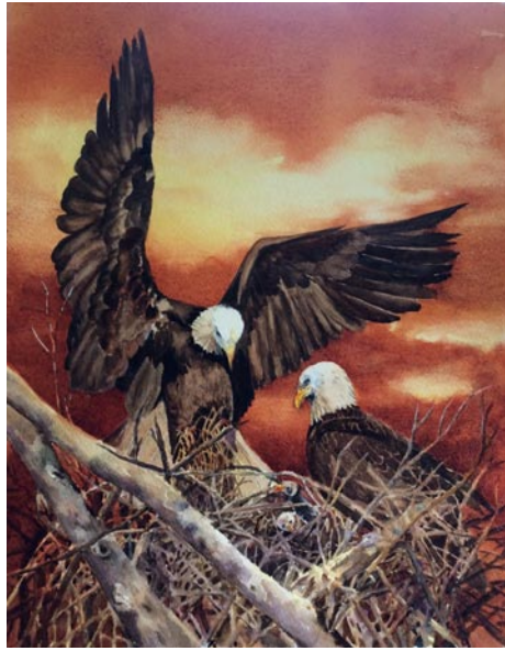
Work by Pat Wilund

For further information check our SC Institutional Gallery listings, call the Society at 843/757-6586 or visit ( www.sobagallery.com ).