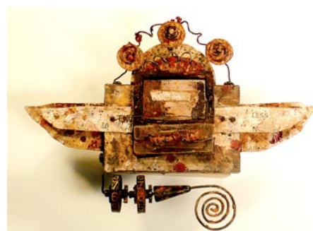
Work by K Wayne Thornley

Shards of glass, rusted wire, machine parts, and salvaged papers are some of the materials that get painted, stained, wrapped and glued together to form tediously-crafted constructions that are both intricate and intimate. Cryptic handwriting and manipulated photos help create a backstory for objects that are designed to engage the viewer in conversation and contemplation of the physical and emotional things we carry through life and the