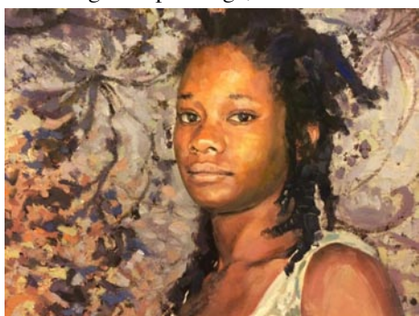
Work by Tyrone Geter

includes fine examples of work by some of America’s best-known printmakers. There is Rockwell Kent’s iconic “Flame,” as well as a majestic figure by Reynold Weidenaar. European printmakers Eric