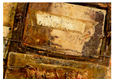
Detail of work by K Wayne Thornley

Thornley, who is also a painter, has been creating mixed-media assemblage work for more than 10 years with selected pieces exhibited nationally and featured in print and online publications. This show will feature new work and pieces created during the last five years. It is the first time the artist’s assemblage work has been shown collectively as an exhibit.