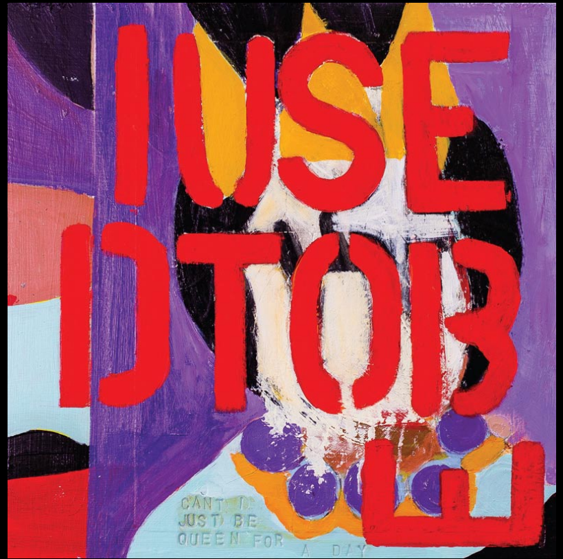
I Used to Be Queen (12x12)